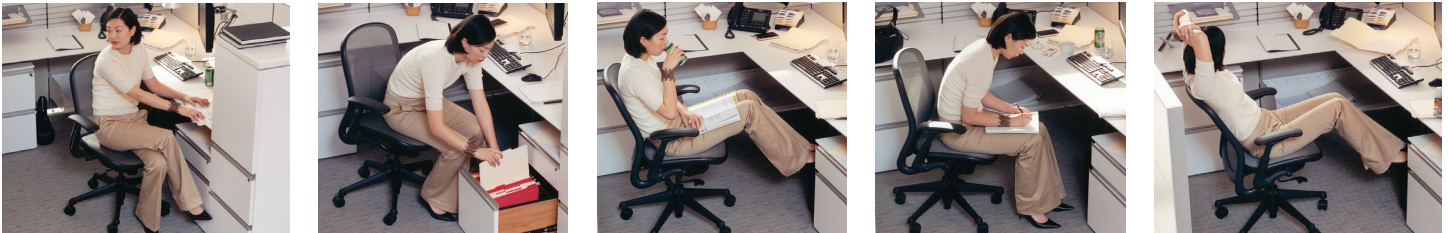
Figure 1. Observed postures

People sit in thousands of different positions. Casual observation of people at work shows a wide variety of postures and positions (figure 1). We sit upright and erect, we slouch, we sit on our feet, we cross our legs, we straddle chairs, we sit sideways, we balance on the front edge, we tip back on the back legs. We literally sit almost anyway you can imagine. This natural tendency has been called “free posturing” (figure 2) (Kroemer, 1994).