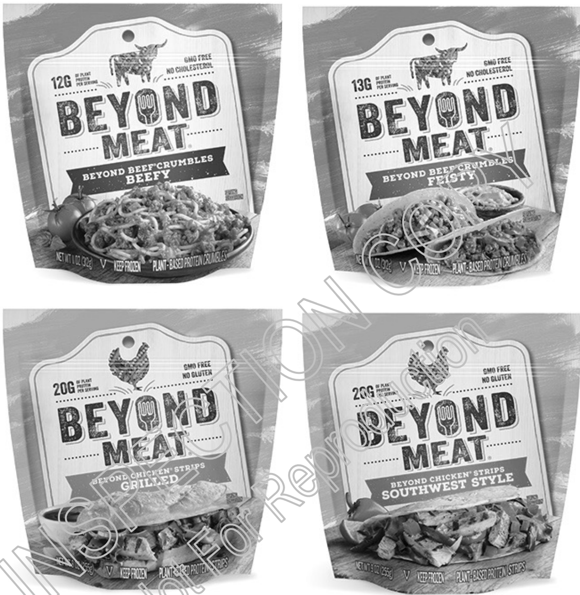
EXHIBIT 5: BEYOND MEAT PRODUCTS AND PACKAGING